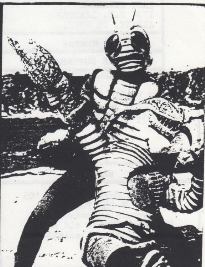
Cobraman (right) says "You bug me!" to Bugman while (left, top) a Skeletor Man gets a kick out of an adversary and (below, left) Skeletor Men are about to be led into battle by their Horned Samurai Leader. From FRANKENSTEIN'S KUNG-FU MONSTER.