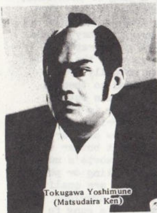
Tokugawa Yoshimune (Matsudaira Ken)

So that's it, OC#5 has finally been completed. The next issue (#6) won't be out until 1985 or later. I shall now go back to work on my other fanzine, "Japanese Movie Sci-Fi," #5. It's very hard to publish two magazines at once. But that's the way I want it. My two favorite subjects are Japanese science fiction and Chinese gung fu. I don't wish to combine the two subjects, so that's why I'm making not one, but two fanzines. JMSF will continue to focus on Japanese science fiction, while OC will probably be geared towards martial arts films. However, this issue does feature an article on Godzilla, but there won't be many more.