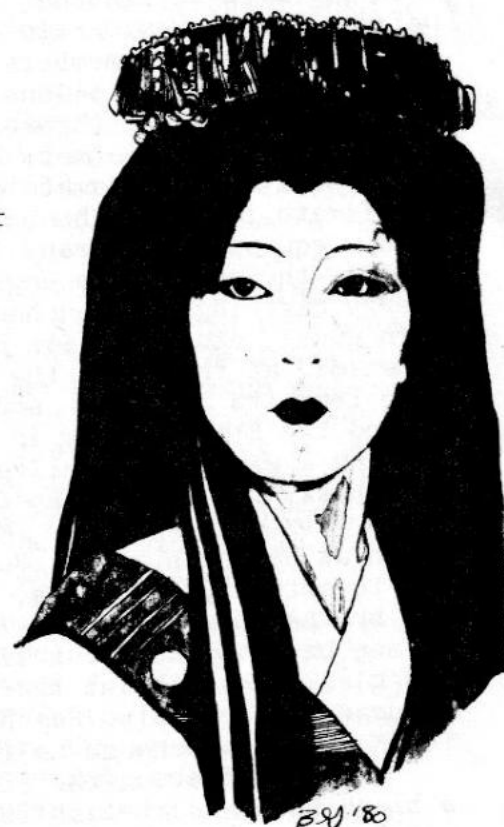
Tamasaburo Bando as Princess Shirayuki