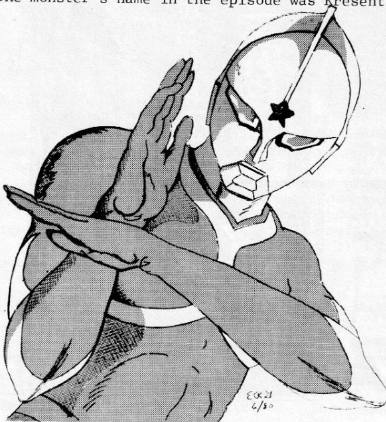
Tsuburaya's THE ULTRAMAN

This brings to a close this double issue of the JFFS Newsletter. Hopefully it has been worth the delay in its production. Also included with this newsletter should be a list of credits for the first season of SPACE CRUISER YAMATO and a new list of merchandise offered for sale to members. PHOENIX 2772 will be featured next time, and another merchandise offering will be made. Till then...sayonara.