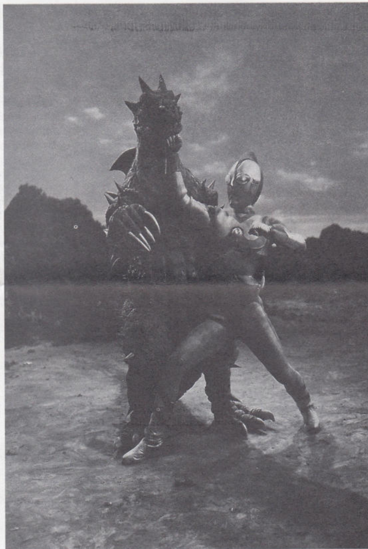
ULTRAMAN 80 IN BATTLE!

The stories, characters (including the female Ultra, Yurian), special effects, and overall production values all add up to make ULTRAMAN 80 a great series. Unfortunately, the show was on during the crest of the Japanese animation boom, making it hard for ULTRAMAN 80 to live up to its potential in the ratings game, so Tsuburaya Pro put the series to rest once again.