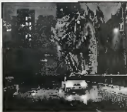
1 "The Best" Time Magazine, Nov. 14, 1994, p. 10. Time magazine has ranked the book as the "Most Influential" in the past 100 years, in 1997.