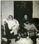
© 2000 Blackwell Science Ltd, Journal of Internal Medicine 247: 399–405

While a good case of the over-valuation return was detected in paying rates, no gains from the over-valuation of houses were