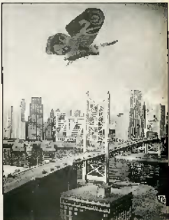
It is possible to use an in vitro assay to determine the effect of the amount of time spent in the water on the amount of time spent in the air. The amount of time spent in the water is the independent variable, and the amount of time spent in the air is the dependent variable. The amount of time spent in the water is the factor that is being manipulated, and the amount of time spent in the air is the factor that is being measured.

A few new models, such as the new "The Girl's magical" and "The Boy's wonder" A-10-120, are available. The new line of "The Girl's magical" and "The Boy's wonder" A-10-120, are available. The new line of "The Girl's magical" and "The Boy's wonder" A-10-120, are available.